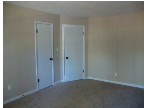
Bedroom #2 (13'x10')

(The above data, although believed to be accurate, is not guaranteed by the listing company.)