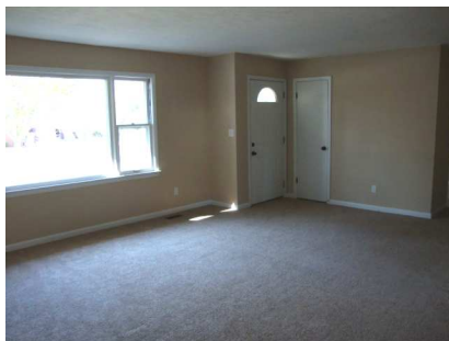
Living Room (21'x14')

Totally remodeled is this 3 bedroom, 2 bath home with approximately 1,200 sq. ft.. Situated on .43 ± acre lot with plenty of shade, fenced rear yard, out building remains, concrete driveway, single attached carport with double gate & exterior of the home has been freshly painted. On the interior you have new carpet, lighting & freshly painted. Seller to contribute $4,000 towards closing costs.