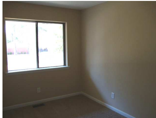
Bedroom #3 (10'x10')