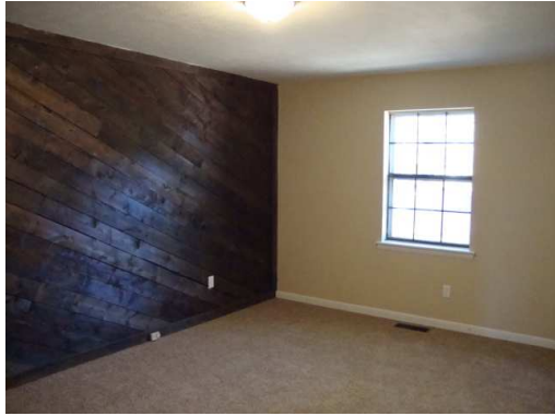
Owner's Bedroom (16'x11')