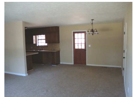
Dining Room (10'x11')

(The above data, although believed to be accurate, is not guaranteed by the listing company.)