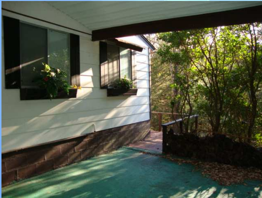
Private entry way to screened porch leading to mother in-law suite or possible rental that has a kitchen, 2 bedrooms, 1 bath & a den.