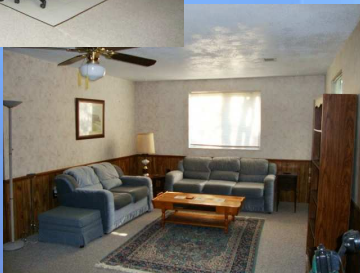
Living Room 29'x13'

Bedroom 10'x16' with 2 closets, triple windows overlooking covered deck & rear yard.