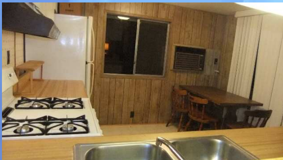
Kitchen 2 10'x11'