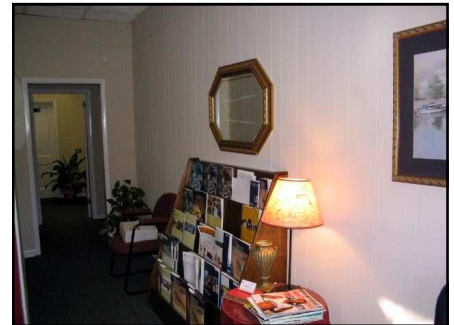
Hallway & Lobby