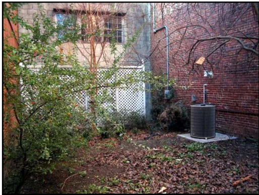
This wonderful garden area located behind the rear office offers a close and quiet place to go in the middle of a busy day. Also, a great place to have lunch in this sunny garden.