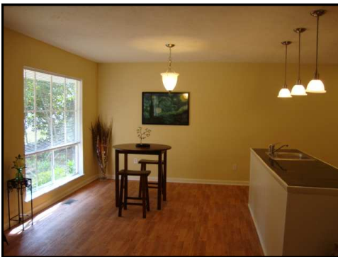
Dining Room (12' x 10')