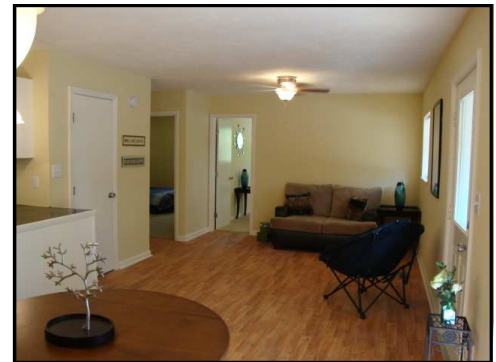
Living Room (13'x12')