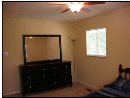
Owner's Bedroom (14'x12')