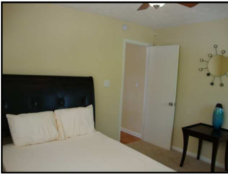
Bedroom #2 (10'x12')