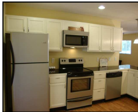
Kitchen (14' x 12')